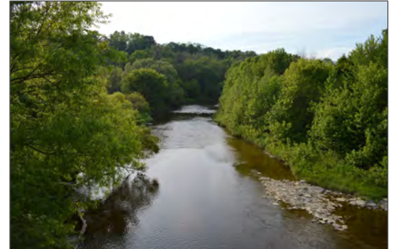
Conneaut Creek looking north from S Ridge Rd bridge.

Trustee Meetings can be joined remotely through GoToMeeting using this URL: https://global.gotomeeting.com/join/643559117