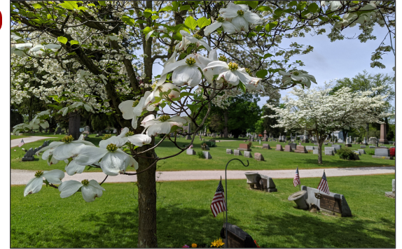
Spring finally comes to Kingsville (Lulu Falls Cemetery)