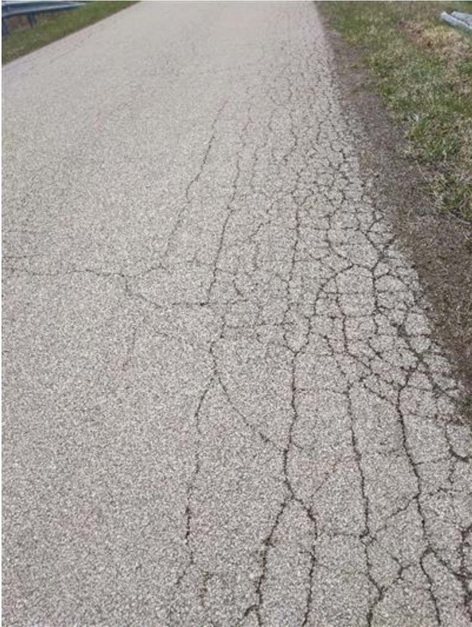
Distress Type: Map Cracking