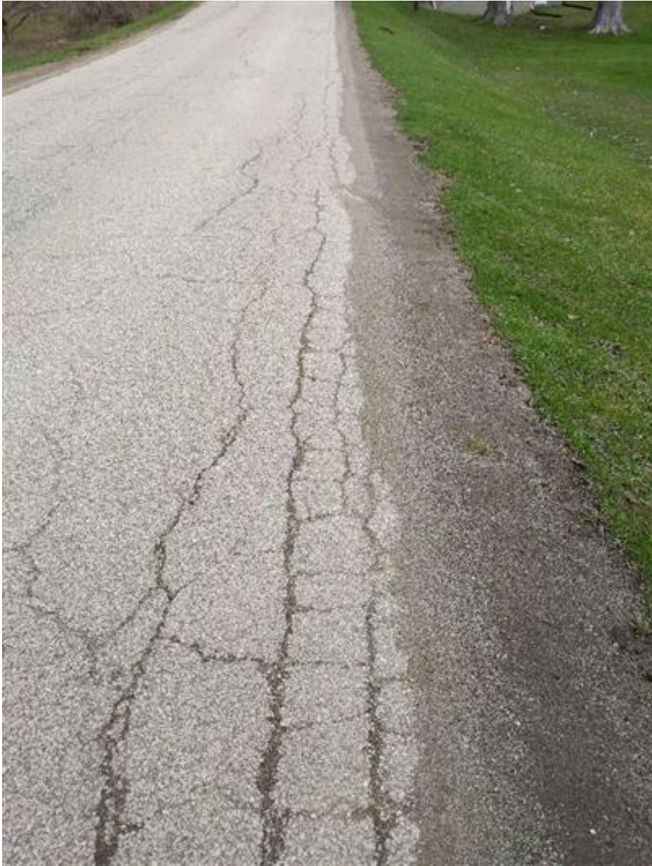
Distress Type: Edge Cracking