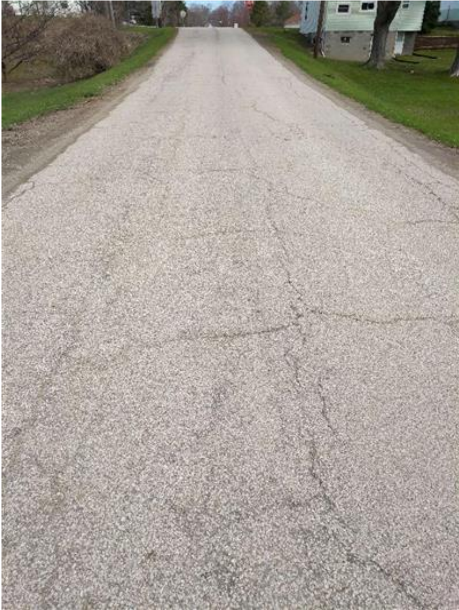
Distress Type: Longitudinal Cracking